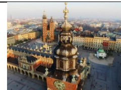
Krakow-Old Town UNESCO World Heritage